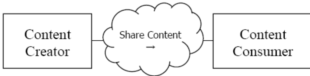
Figure X.3-1. Actor Diagram